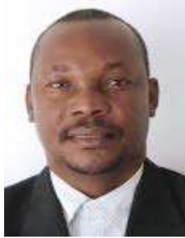
The Mayor, Cllr manyuha Lucas Masindi